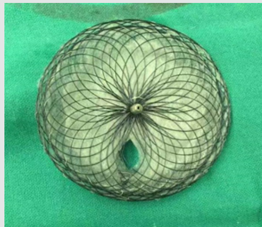
Figure 2: Occlusion of the occluder in advance reserved hole 5mm.