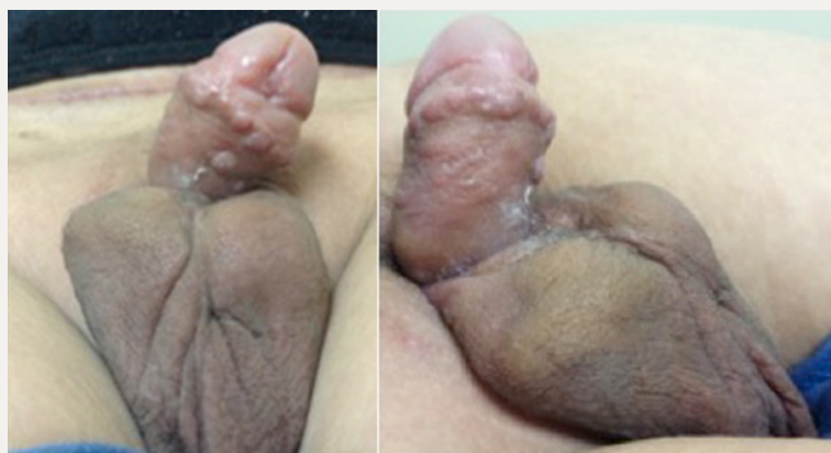
Figure 3: Postoperative Aspect after 6 Months.