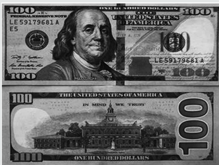
Figure 1: An example of a $100 bill follows.

Figure 1 Recognizing that the world was built from people using their Minds, facilitates social reform from being primarily guided by money considerations, to at least some emphasis that money, and what it is used for, is a creation from and for society by people using their Minds. Social guidance may be more socially significant today, than any other point in history. A two-penny tax on each credit card transaction could generate than $1B annually for social purposes, perhaps health care (for instance the poor). Why Not? The people paying the credit card fee would be the people getting health care. Obviously, the funds could be used for any social purpose, but should be used to impact the greatest number of people. A better use of the money generated may be to use it as a fund for all Politicians raising money for election purposes. In other words, this could minimize, or perhaps eliminate, the need for big donors who have significant control of the Congress and Senate in America. If more money is needed for political campaigns than merely increase the tax to 3 peenies which would generate multiple billions of dollars annually.