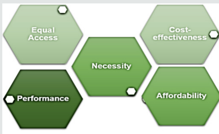
Figure 1: The Pentagon of Healthcare Goals (adapted from Kocher and Oggier [4]).

Further, healthcare's scientific quality-characteristics provide diverging criterions, as well, however, seen from another vantage point. Generally, according to (Figure 1), they are measured by equal accessing opportunities, per-formance (e.g., rapid and effective treatment), treatment's necessity (i.e., deterred by finan-cial and/ or lobbying power), cost-effectiveness (i.e., cost-benefit ratio), and affordability (Kocher and Oggier)[4].