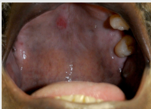
Figure 1: Primary Syphilis affecting the mouth (palate).

reddish maculae or maculopapular eruptions called syphilitic rosette [6]. In some cases, lesions looking like condyloma latum may also occur in the oral cavity, with the labial commissure as the preferred site of involvement [6]. Ulceronodular disease or "Lues maligna", also called malignant Syphilis an aggressive generalized form of secondary syphilis which presents with fever, headache, and myalgia, followed by a papulopustular eruption that quickly converts itself into necrotic, sharply demarcated ulcers with hemorrhagic brown crusts [7]. It is seen usually in immunocompromised hosts but rarely also in immunocompetent hosts. These crusts are organized in rupioid layers, usually on the face and scalp. The mucosa is involved in about one third of affected patients [7]. Lues maligna can cause crateriform or shallow ulcers on the gingivae, palate or buccal mucosa, with multiple erosions on the hard and soft palates, tongue and lower lip [7]. Other atypical or non-specific lesion may be found in secondary syphilis, like aphthous ulcers or other painful or painless ulcers [8].