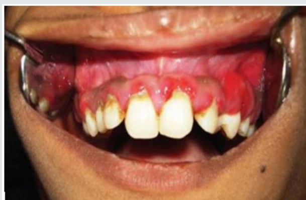
Figure 3: Generalized Aggressive periodontitis.