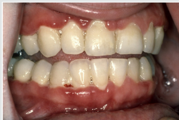
Figure 2: Acute Necrotising Ulcerative gingivitis.