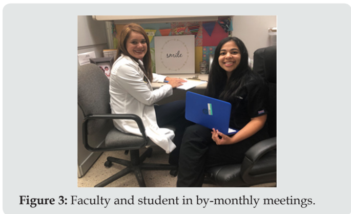
Figure 3: Faculty and student in by-monthly meetings.