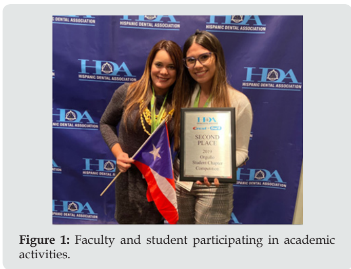
Figure 1: Faculty and student participating in academic activities.