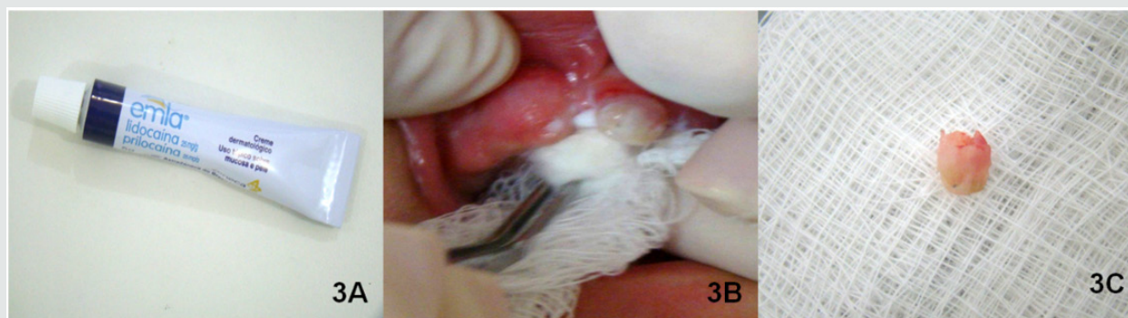
Figure 3: A) Topical anesthetic EMLA (Lidocaine Hydrochloride 2.5%). B) Topical anesthesia, being careful to avoid that the baby could swallow the anesthetic. C) Neonatal tooth in the region of upper left central incisor extracted.