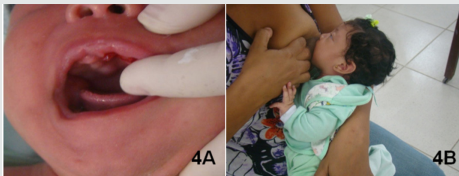
Figure 4: A) Clinical appearance immediately after the extraction.

No vitamin K prescription prophylaxis was performed because the baby had already achieved the normal safe levels. Initially, the mucosa was dried and a topical anesthetic (EMLA - lidocaine hydrochloride 5%) (Figure 3A) was applied with cotton three times, being cautious to prevent its ingestion by the baby. The extraction was performed with sterile gauze (Figure 3B & 3C). Cotton gauze was applied with pressure for hemostasis and the mother was told to immediately begin breastfeeding because the breast milk contains immunoglobulins which promote healing and the intimate contact with the mother provides security to the baby [4] (Figure 4A & 4B).