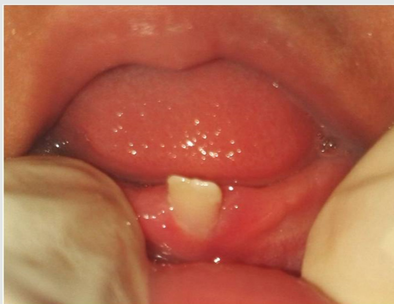
Figure 7: Healing one-month post-extraction.