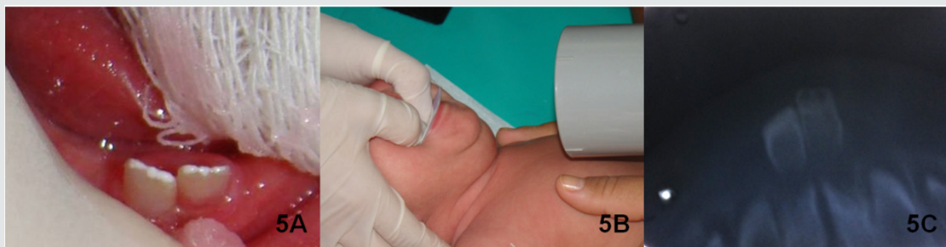
Figure 5: A) Neonatal teeth in the region of lower central incisors and lack of ulcer on the ventral surface of the tongue.

B) Taking the radiograph using the modified occlusal technique.