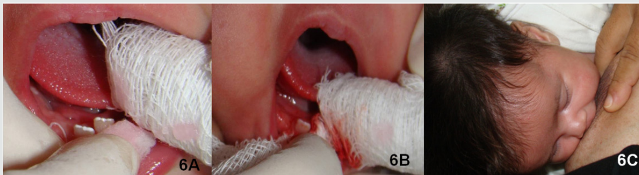
Figure 6: A: Topical anesthesia, being careful to avoid that the baby could swallow the anesthetic; B: Lower left central neonatal tooth being extracted. C: Child being breastfed, just after the extraction.

of aspiration and caused more difficulty during breastfeeding. The extraction was performed following the exact same protocol as the first case (Figure 6). Additionally, the same healing process occurred as in the first case. We followed-up by phone the day following and one week following. Then one month after the exam, the patient returned to the clinic where the right mandibular central incisor presented with no increase in mobility (Figure 7).