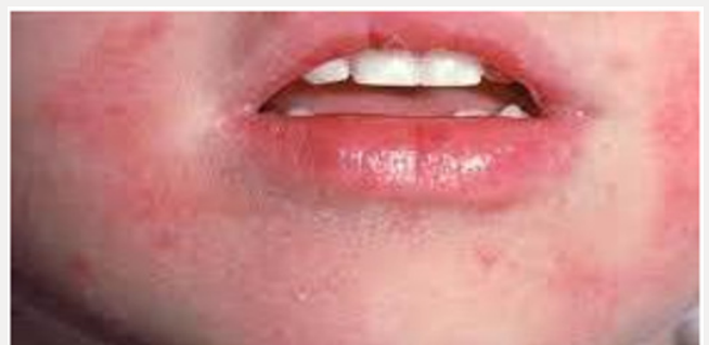
Figure 1: Hypersensitivity reaction on face.

A 7-year-old boy came to the clinic one day after pulpotomy treatment. The chief complaint of the child's parents was the appearance of a large red spot with itching and dried skin on the both sides of the patient's face, on the areas of the cheek, under the lower lip, and the chin. As the mother explained, these symptoms occurred immediately on the kid's face one day after the treatment was completed. The patient had no history of medical illness before.