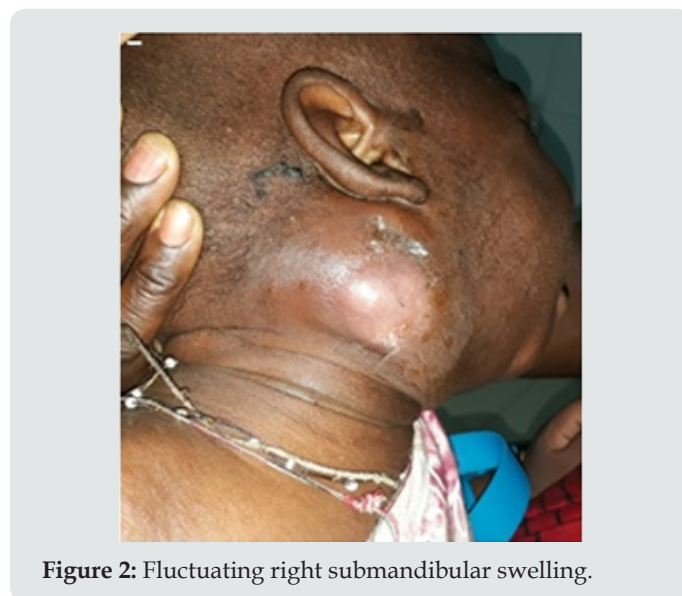
Figure 2: Fluctuating right submandibular swelling.