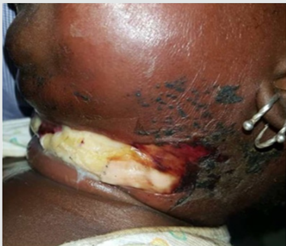
Figure 3: Necrotizing dermo-hypodermis complicating a cervical lymphadenitis.

without tonsillectomy was performed remotely within an average of 1.5 months after hospital discharge in 28% of cases.