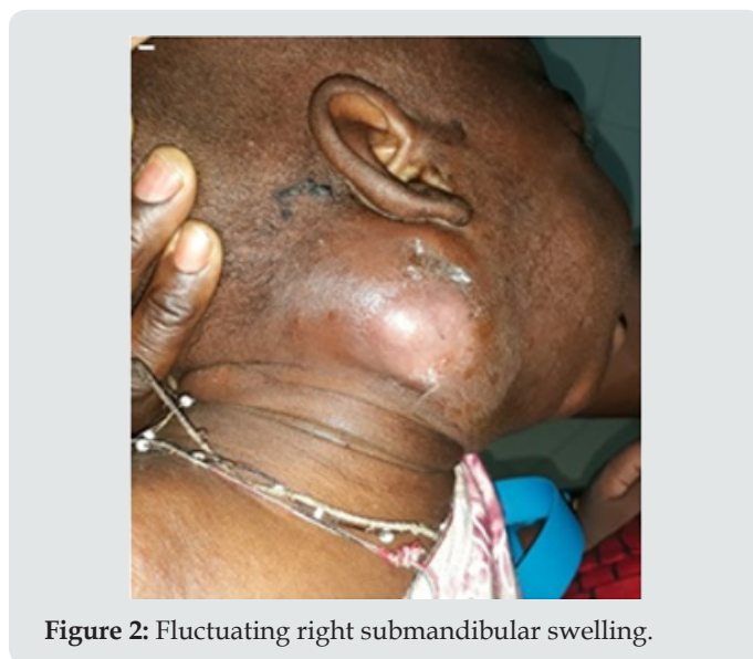
Figure 2: Fluctuating right submandibular swelling.