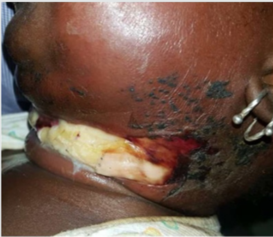
Figure 3: Necrotizing dermo-hypodermatitis complicating a cervical lymphadenitis.

without tonsillectomy was performed remotely within an average of 1.5 months after hospital discharge in 28% of cases.