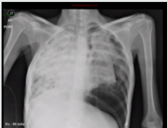
Figure 3: Chest X ray.