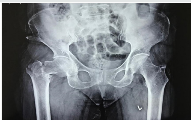
Figure 1: Preoperative X-ray.