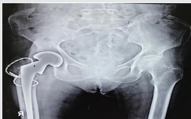
Figure 3: 1-year postoperative x-ray.