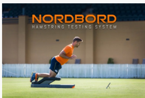
Figure 3: Nordic hamstring exercise on scientific nord board (Developed by Vald performance).

Alternatively, a scientific Nord board is a fast and easy way to accurately measure eccentric and isometric hamstring strength (Figure 3). The English Premier League title winner (2015-16