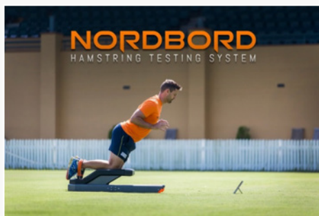
Figure 3: Nordic hamstring exercise on scientific nord board (Developed by Vald performance).

Alternatively, a scientific Nord board is a fast and easy way to accurately measure eccentric and isometric hamstring strength (Figure 3). The English Premier League title winner (2015-16