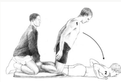
Figure 2: Customary Nordic hamstring exercise (NHE) (Mjolsnes et al., 2004).