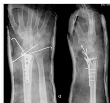
Figure 3: Postoperative PA and lateral radiographs of the right wrist show maintained reduction of the radiocarpal joint after radiocarpal fixation with 3 Kirschner wires.