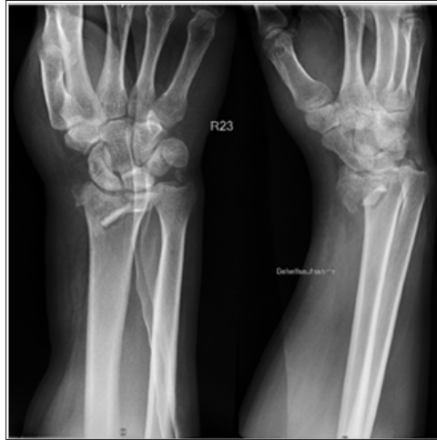
Figure 1: Simple AP and lateral radiograph obtained upon arrival at the emergency service at the foreign hospital.

the cast and the kirschner wires, the patient presented flexion of 20° and extension of 15°, which improved up to flexion 30° and extension 60°, supination 60°, with preserved pronation, 24 months after the trauma. At this time, the patient reports no pain, feeling of instability or signs of nerve compression. The DASH disability score result was 3,1 and the Mayo Wrist Score was 93. The radiograph control did not show any relevant alteration (Figure 4).