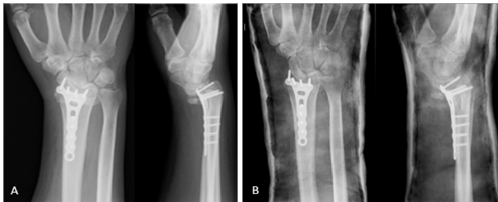
Figure 2: (A) Posteroanterior (PA) and lateral radiographs of the right wrist show volar dislocation of the carpus at our emergency department (B) Postreduction attempted failed PA and lateral radiographs of the right wrist.