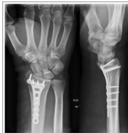
Figure 5: Postoperative PA and lateral radiographs of the right wrist after surgery at the foreign hospital.

The management of radiocarpal dislocations varies, since there are different therapeutic options and no long-term follow-up data. Most authors propose a surgical treatment, but nonoperative management has been successful and also reported positive functional results in several series [5].