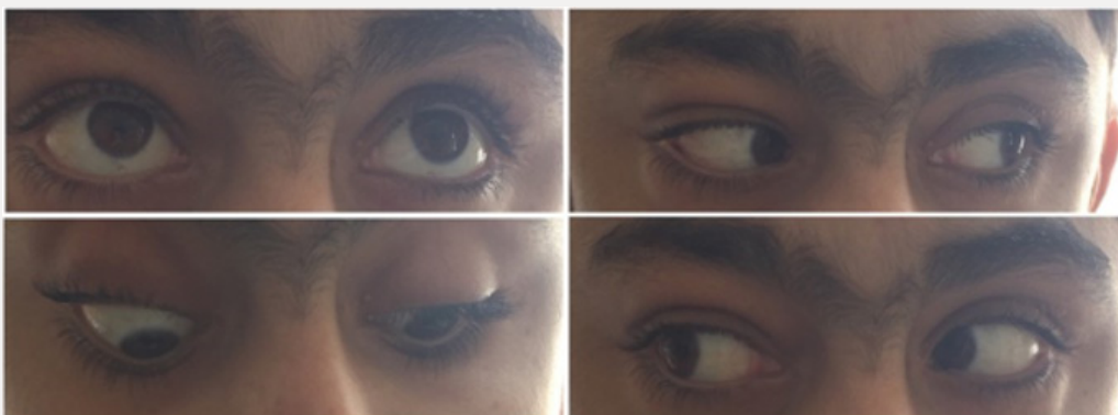
Figure 3: After chemotherapy.

In the orbital contrast enhanced magnetic resonance imaging of the patient who was admitted to the Department of Pediatric Oncology at the same day; there were a mass lesion compatible with metastasis in the posterior-external wall of the right orbit,