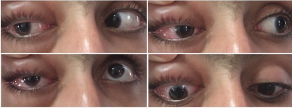
Figure 1: Before chemotherapy.