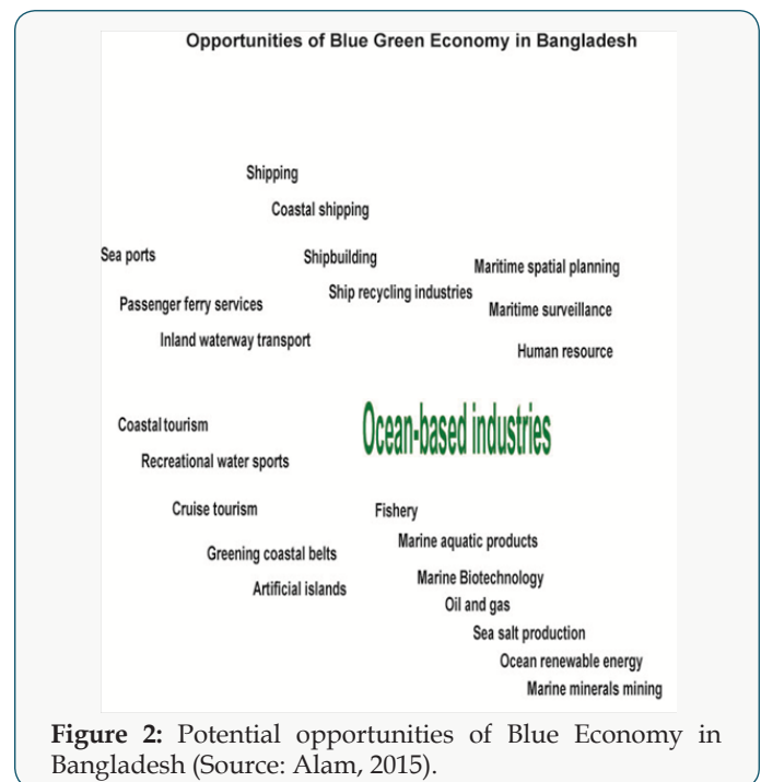
Figure 2: Potential opportunities of Blue Economy in Bangladesh (Source: Alam, 2015).

generation of sustainable and inclusive livelihoods [14]. To obtain these balanced approaches between conservation, development and utilization of marine and coastal eco-systems is needed. To meet the next generation demand it is high time to explore the ocean resources. For this extensive and integrated research can play an important role (Figure 2).