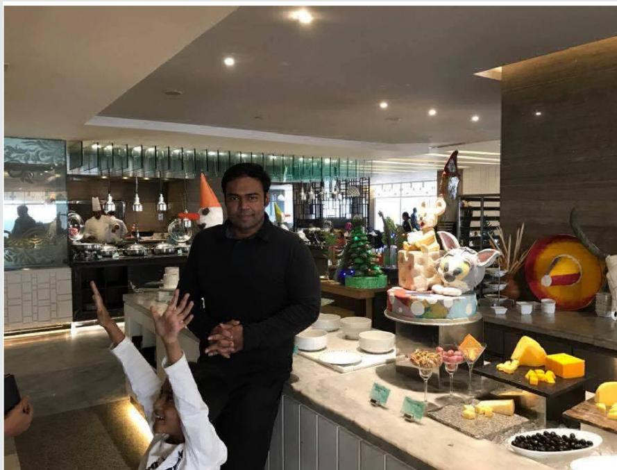
Figure 2: The Author.