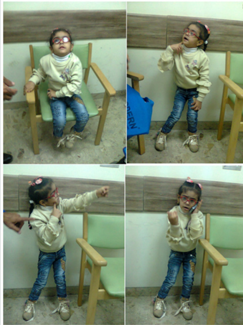
Figure 2A: The girl with kernicterus before treatment.