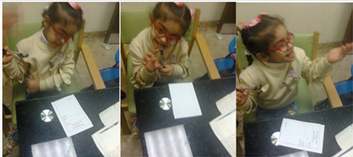
Figure 2B: The girl with kernicterus after two months treatment.