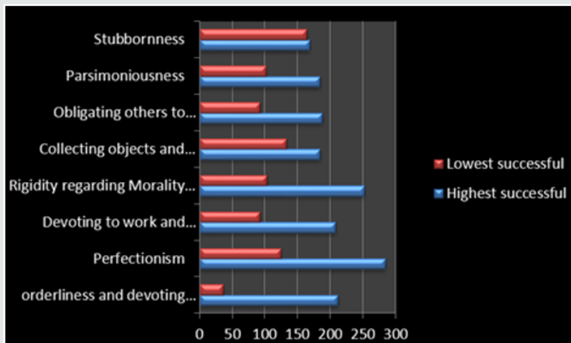
Figure 2: Frequency of obsessive-compulsive traits among participants.