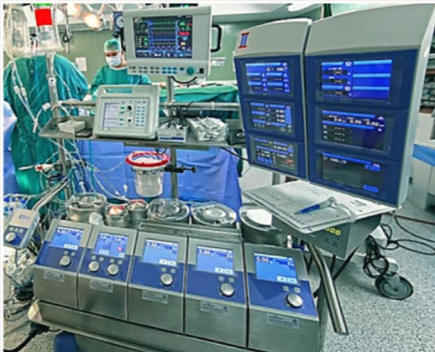
Figure 1: Heart–lung machine in the cardiac operating room: Fifth generation of roller pumps (Sorin Group, Munich) with control and monitoring panels.

CPB can be halted by running a cardioplegic solution containing potassium citrate. The initial concept to constitute an artificial circulation and hence CPB was stated in the 19th century on the basis that the contractility of muscle could be restored by perfusion of an oxygenated blood under pressure to enable better perfusion of isolated organs. Therefore, there was a need to develop an artificial heart-lung system to perfuse an oxygenated solution without interruption of blood flow, which became a real in the beginning of the 20 th century after discovery of the ABO blood group system to reduce inconveniences of incompatibility, in addition to discovery of heparin to inhibit coagulation [1].