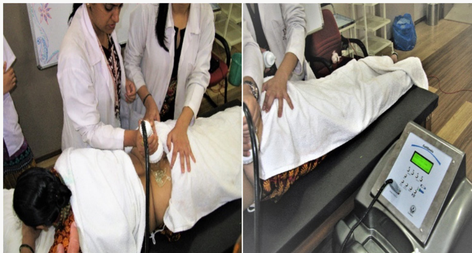
Figure 1: Here we see a treatment in progress with CellSonic VIPP

new tissues take time to grow and have to be stimulated to grow. It is interesting that no drug can cause these changes. Only the effect of the VIPP (very intense pressure pulse) technology works. Quite apart from the benefit to the patient, the cost and time savings are enormous (Figure 1) and (Table 1).