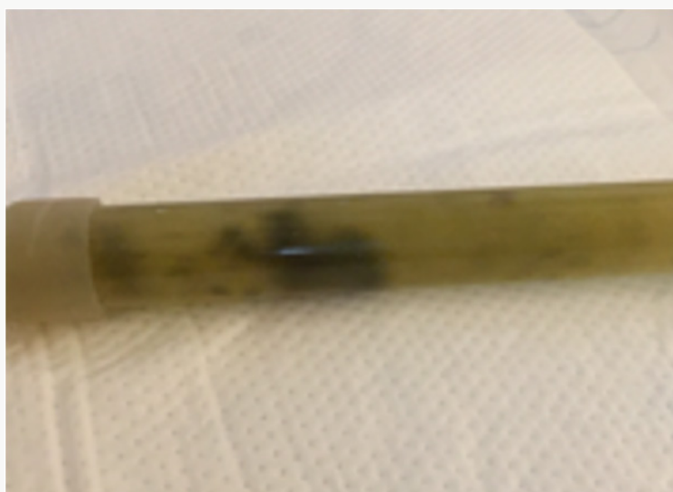
Figure 2: The bowel

One way to understand the balance is to think not just of the balance of the body's nutrition but the requirements of our microbiome, the masses of bacteria that collectively support our health. It can be argued that the microbiome is not there to support us but that we are living to host the microbiome. There is a constant balancing programme running to keep the bacteria fed so that it can reproduce without harming its host. The behaviour of gut bacteria is controlled through the vagus nerve, the 10th cranial nerve that runs from the brain stem down to the abdomen [10]. Dr Mercola reports that the makeup of gut microbiome can have a tremendous influence over psychological health and well-being affecting both the general mood and a risk of more serious mental health dysfunction (Figure 2).