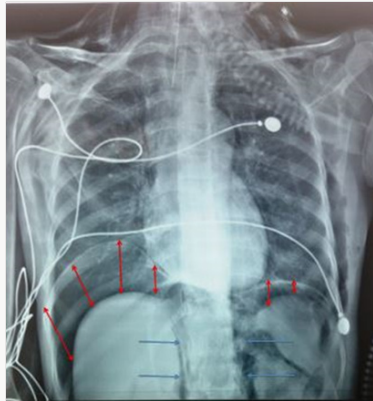
Figure 1: Chest x-ray showing pneumoperitoneum (red) with retro pneumoperitoneum (blue).

Conservative management was adopted as the patient was clinically improving, she was weaned of vasopressors and mechanical ventilation 5 days later, subcutaneous emphysema and abdominal distension steadily resolved and the patient was discharged to medical ward after 10 days stay in ICU.