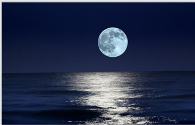
Figure 1: Transitory distraction is an important cause for fatality in road traffic accidents as it clarifies an indefinite.

Road traffic accidents, involving Motorcycles is one of the most common cause of mortality in this modern world. In fact, the mortality due to motorcycle accidents have amplified in recent times. For millions of adults, driving the motorcycle may be one of