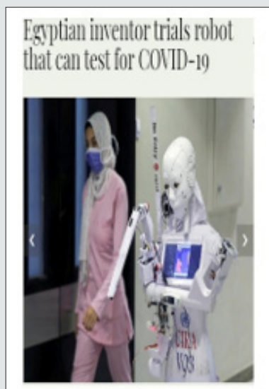
Figure 3: Illustrated Cairo 3, a remote-controlled robot.