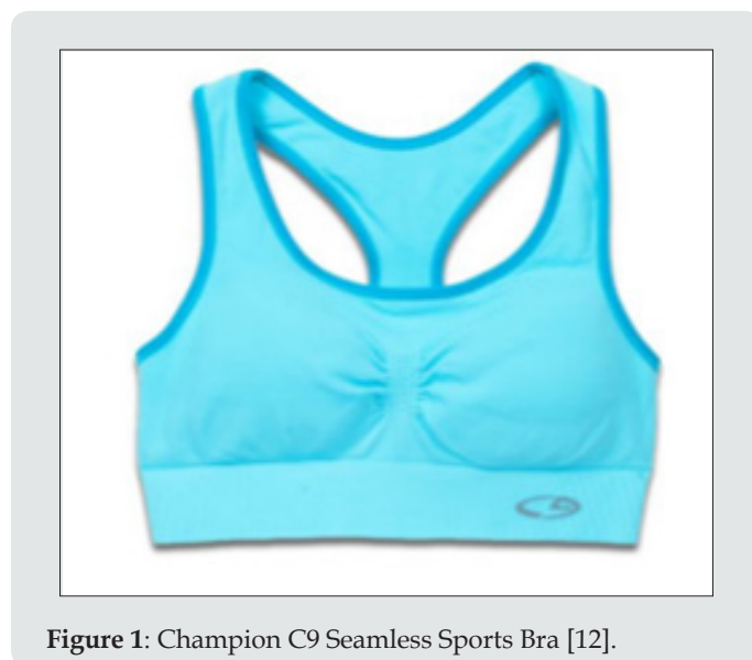
Figure 1: Champion C9 Seamless Sports Bra [12].

Multiway stretch ability is favored because sports bra fabrics must be able to expand greatly in both wale and course directions [8]. Seamless circular knitting technology and sew-free technologies have been implemented in the manufacture of intimate clothing and sports bra is also being developed with this technology. However, a typical commercial seamless sports bra (Figure 1) has following parts: under bust band, breast encapsulation via center front material rouching, racer back straps, and elastic binding at armholes and neckline edges [12]. For sports bras, there are five major back designs: crossover, racer back, vertical center, straight back, and U-back [8]. Racerback bras provide good support for medium- to high-impact activities and allow for a full range of motion [16] (Figure 1). During the wearing of a sports bra, some common problems occur, such as bra deformation, strap slipping, and skin trenching [10]. Bra chafing problem is termed when bra rubs against skin in unpleasant ways. However, a well-designed efficient sports bra meets the following criteria: