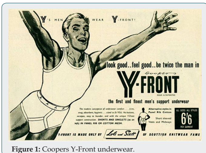
Figure 1: Coopers Y-Front underwear.

The fitted knee-length apparel that men wore beneath their pants was not very comfy. This led to the invention of the elastic waistband in the year 1925 and this led to the development of boxer shorts. Thus, the underwear for men become much more resilient and supportive [7]. 'Look good... Feel good... Be twice the man in Y-front', was the quote that described the very first men's brief (Figure 1). This came in as a pleasant surprise for the male population who needed something lot more supportive down there [8]. However, it is lesser known fact that boxer shorts were not the very first invention in men's underwear industry. Jockstraps were invented way before in the late 1800s. This skivvy style was specifically invented to provide comfort and support to the cyclists [9]. Pioneered by the designer, John Varvatos, boxer briefs were introduced in the year 1990. Combining the length of the boxers and the snug fit of brief, this underneath article took the entire industry by storm. The aesthetically revolutionary underneath article is till date the most used style [10].