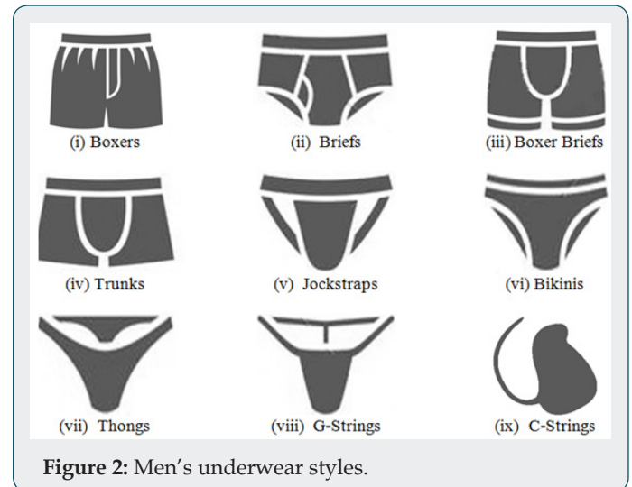
Figure 2: Men's underwear styles.

underwear was simple and limited. Despite the fact, the underwear is a lesser talked about subject in menswear; the options available in this category these days are ample. It makes more sense to wear a different style when travelling, working out at the gym or when wearing trim denim or trousers instead of wearing the same style for all day every day. The different aspects of the various styles of men's underwear are given in (Figure 2).