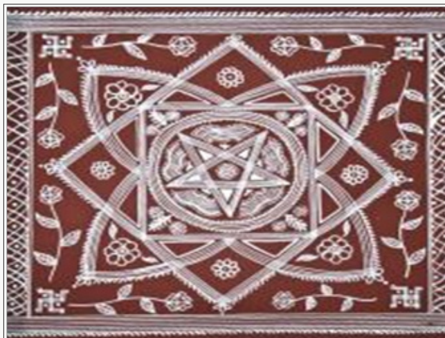
Figure 2: 3 Kumaon Aipans.

eventually will be reduced to rudimentary, technical and structured living where fashion, beauty and myths have no place. Another thing that has guaranteed the disappearance of organic growth of trends is the structured curriculums of the design institutes. It is very interesting to note that a group of design students might be seen wearing same trends aspired by vogue and Bollywood where as a illiterate worker even with his meagre sum will be seen more differently and culturally dressed in many a different ways. Why is it so?