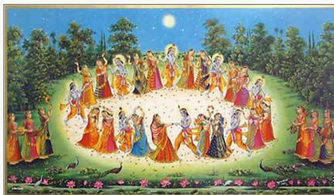
Figure 1: Raas Leela.

But how do we not let off those trends which are heritage and iconic. It's like death of languages, a culture and a context gone forever. Is keeping them in museums and encyclopaedia enough or should we not utilise them as platforms of innovation, growth and experimentation. Each and every trend is a sign that society is expressing itself and that social fabric is democratic enough to allow individuality to flourish and expand. Not only this, we need to create kaleidoscopic places where different trends are juxtaposed and one switch between them as we shift contexts. Translation of a trend into a new interface is an important act of holding the myth of that trend together and giving it a life so as to organically evolve into a new user experience, keeping the natural flow and essence of trend alive.