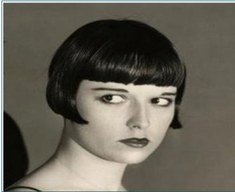
Figure 3: Bob Hair Cut.