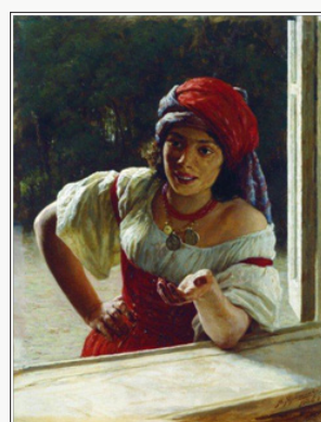
Figure 1: Traditional Bohemian Look.

Alongside Romantic Movement, for the first time, bohemian dress ended up as representative and expressive of an individual personality highlighting their poverty and originality [7]. The fashion style of "boho-chic" that prevailed in the early years of the 21st century is in contrast to the late 19th century and first half of the 20th, where the Bohemian fashion reflected the lifestyle