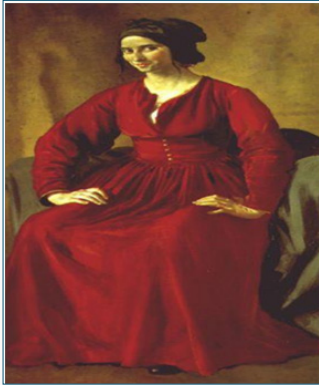
Figure 2: Dorelia Look.

itself [8] (Figure 1). In the early 20th century, full skirts and bright colours of the Dorothy “Dorelia” McNeill (1881– 1969), muse and second wife of the painter Augustus John (1878–1961) earned the name Dorelia look. Meanwhile the Sapphic dance themes of Natalie Barney further extended the alternative lifestyle of an adventurous feminist culture [9] (Figure 2).