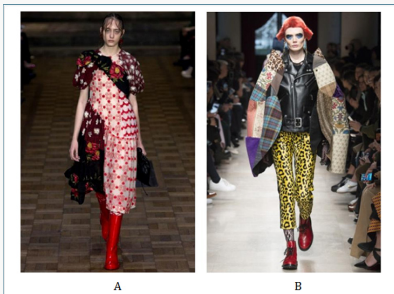
Figures 6: A: SS 2017– Simone Rocha; B: FW 2017– Junya watanabe.

Floral patterns, paisley or geometric prints, mystic metal jewellery, head wrap or an oversized hat, feathery earrings, sandals or boots make a perfect prop for an unkempt environment [16]. Notwithstanding mixing up patterned and printed silhouettes, ruffles skirts with non symbolic accessories sports a crafty multi colored kitsch outlook [17]. This choice for non-bourgeois style undermines the free spiritedness and no prejudice barred approach in flaunting new semantic attributes a lag lamping attitude. The whole concept is about crossing the threshold limit and experimentation seeking inner harmony analogous to the bohemian rhapsody the 3rd best selling UK single of all time that focuses on a more emotional level [18]. This deconstructed trend entered the design houses of Diane von Furstenberg, Simone Rocha and Junya Watanabe in fall 2017 runway emphasizing the overall aesthetic carefree and feminine [19](Figure 6).