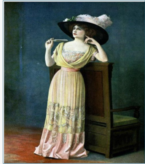
Figure 4: Parisienne Women.

The 20th Century bob hairstyle which served as symbolic of independent and progressive woman furthered the cause of bohemian lifestyle. And Protagonist roles of Julia Roberts in “Pretty woman” and Uma Thurman in “Pulp fiction” did help to expand the reach of this new lifestyle [10] (Figure 3). To add on to this bohemian lifestyle is the works of Dora Carrington whose unique, colourful depiction of fruits, flowers, and a brightly plumed bird on a brass urn and the painting of Female Figure Lying on Her Back speaks about the intuitiveness and uninhibited feminine expressions [11]. Parisienne women preferred grotesquely large hats, gold or silver thread embellished patterns sometimes laced with flowers, fruits, feathers and ribbons” to add to the decorum. Even comic operas, “The bohemian Girl” did stage everyday dress design similar to bohemian look [12] (Figure 4).