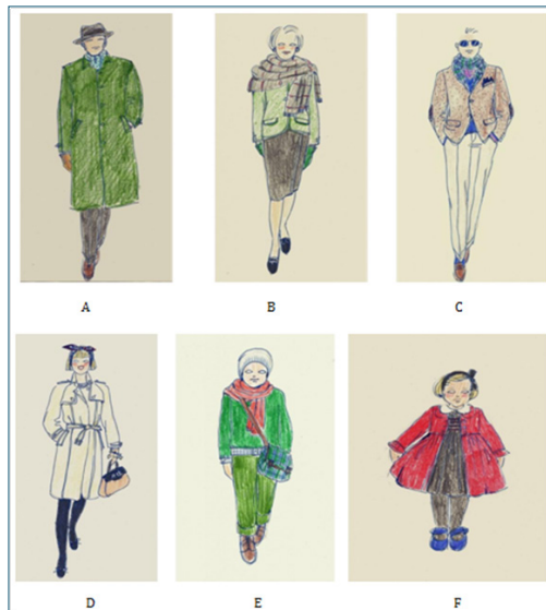
Figures 5: A: BCBG Grandfather; B: BCBG Grandmother; C: BCBG father Bon chic Bon genre; D: BCBG mother; E: BCBG son; F: BCBG daughter.