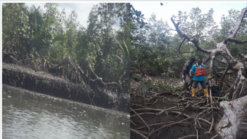
Figure 3: Dead Rhizophora spp (mangroves) due to roots suffocation at location close to flow line

severely disrupt natural regeneration of forest edges.