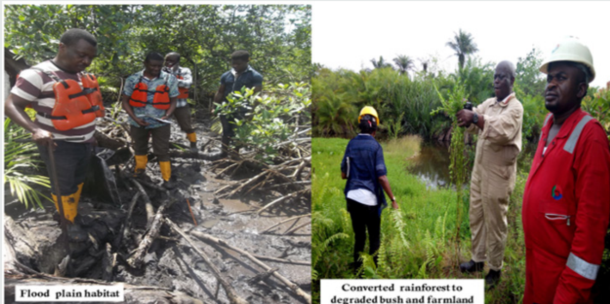
Figure 2: Ogoni land used to be covered with a rainforest but has been largely converted to degraded bush and farmland.

activities. In the Freshwater and Barrier Island Forests, forest utilization is second only to agriculture as the most significant economic activity in the freshwaters wamp forest zone.