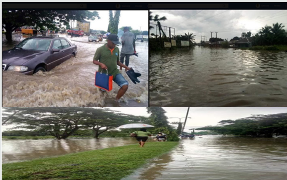
Figure 1: Plate 1. Incidences of flooding threatening township streets in some areas.

jetties also caused coastal recession. For instance, at the mouth of the Escravos river, Ogborodo beach have receded by 20 m per year since breakwater construction Abam [6] Tidal erosion occurs in the Southern parts of the Delta as a result of high tides in combination with waves that had affected a number of townships and islands Figure 1.