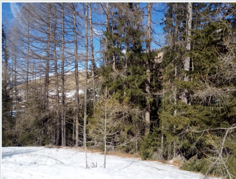
Figure 1: Alps and Climate.

I invite you to cooperation to save lives on the planet.