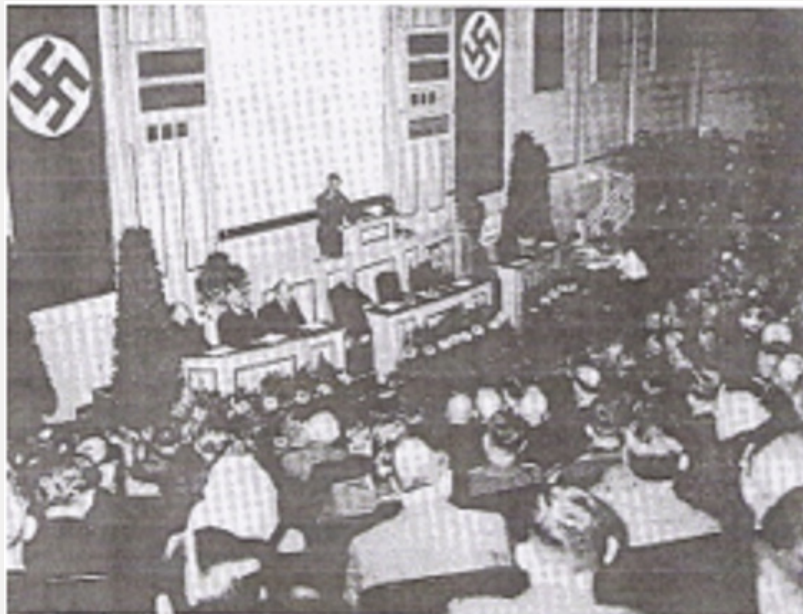
Figure 6: VII th congress of the German dentists directed by Ernst Stück in 1935, in Berlin (public domain).