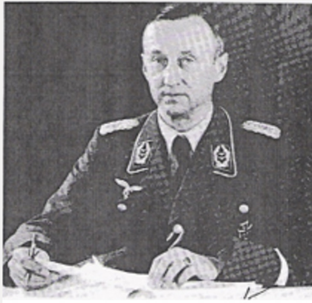
Figure 5: Reichszahnärztführer Dr. Ernst Stück (1893 – 1974) (public domain).