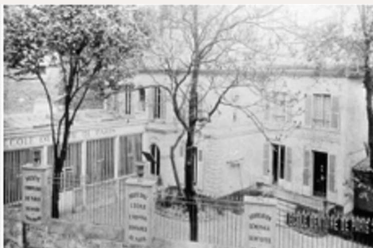
Figure 3: Dental School of Paris - 57, rue Rochecouart (public domain).