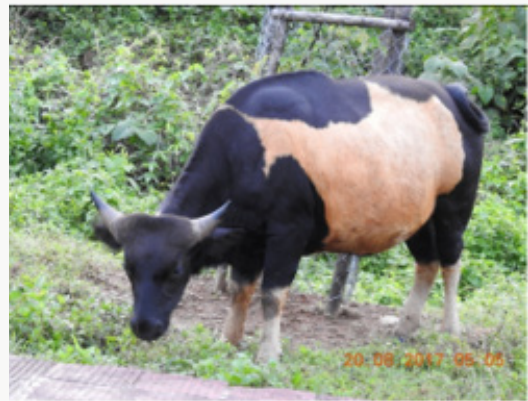
Figure 3: Bos frontalis (Mithun) Female (Hybrid of Arunachali and Mizorami strains).