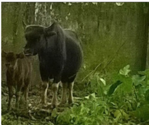
Figure 1: Bos frontalis nagami (Mithun) Female with Calf.