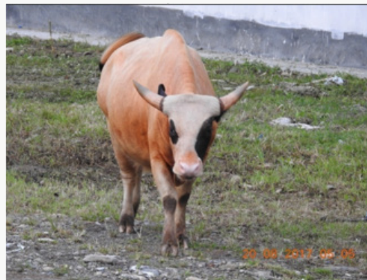
Figure 4: Bos frontalis arunachali (Mithun) free wandering Male.