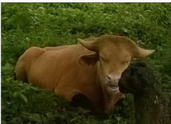
Figure 2: Bos frontalis arunachali (Mithun) Male resting for rumination.