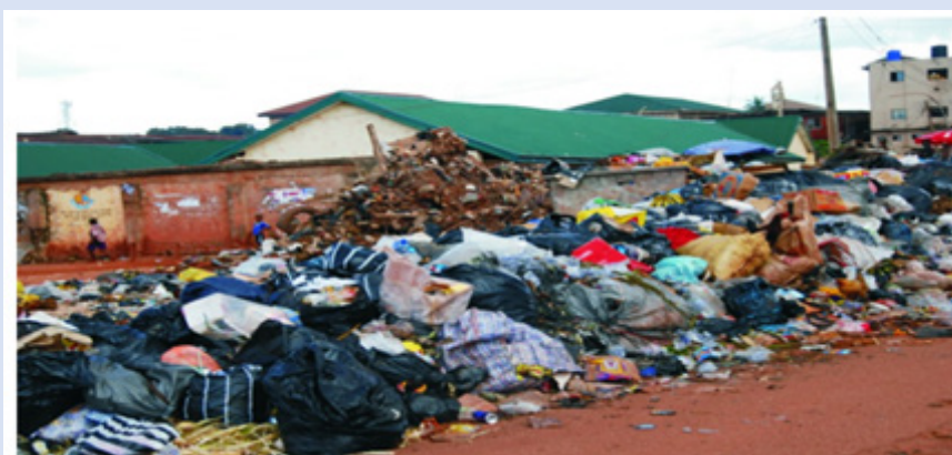
Figure 3: Illegal Waste Dumpsite in Ibadan city, Nigeria, Source: [35].

The government of Nigeria has made attempts to educate its citizens about waste management (Nwachukwu, 2008). Several workshops have been done to train people to understand hazardous waste and the need for proper disposal of garbage in designated dumpsites. The emphasis of these training workshops is to encourage the safe disposal of waste and encourage recycling activities [15]. However, Figure 3 above shows that illegal disposal of waste in main cities remains a major problem.