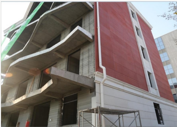
Figure 4: 6-story 3D printed apartment building (Sevenson, 2015).

then take advantage of AM printing techniques to retrofit these structures with 3D printed parts, to enhance their service life in the most economical manner (Figure 4).