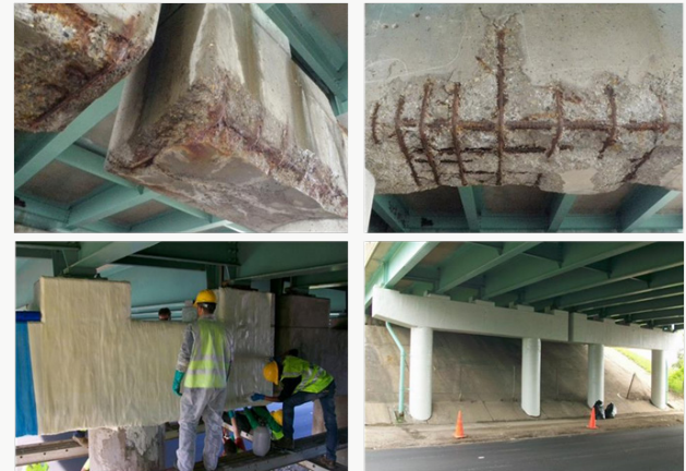
Figure 3: Rehabilitation using FRP wraps of Madison Avenue Bridge, Huntington, WV (WVU, 2014).

The advances through government sponsored programs resulted in developing numerous private and government codes and design guidelines, including FRP rebar, FRP strengthening of concrete members, and FRP design specifications for pultruded shapes. These codes and specifications would not exist today if not for previous government sponsored work. Advent of these codes will help FRP composites to compete on a level playing field with other construction materials like concrete, steel, wood and aluminium, materials with well-established codes. Performance criteria for design, specification and installation will mean a higher degree of confidence for professional engineers and contractors to design and construct with advanced composite materials, in addition to instilling confidence in owners to field implement advanced FRP composite materials (Figure 3).