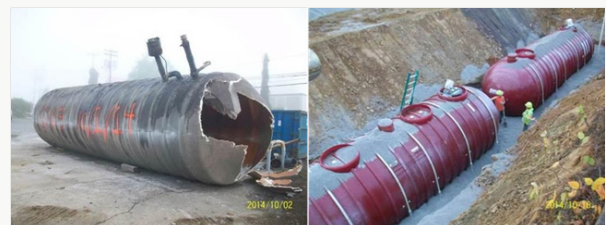
Figure 1: Durable FRP Gas Tanks (Liang, 2014).

Over the past 30 years, various federal and state agencies have worked in cooperation with American composites industries to promote and advance the FRP composites for civil infrastructural applications. The shipment of advanced FRP composites in the US is about 5 billion lbs annually with about 32% of share in transportation and 21% in construction. Civil infrastructure relies on codes and standard practices built on the lessons learned over years of implementation. As such, the incorporation of new materials is outside the scope of the current codes, which increases the risk and complexity of the project. The US government has played a unique role in accelerating the adoption of advanced composite materials in advancing these materials for civil infrastructure projects (Figure 1).