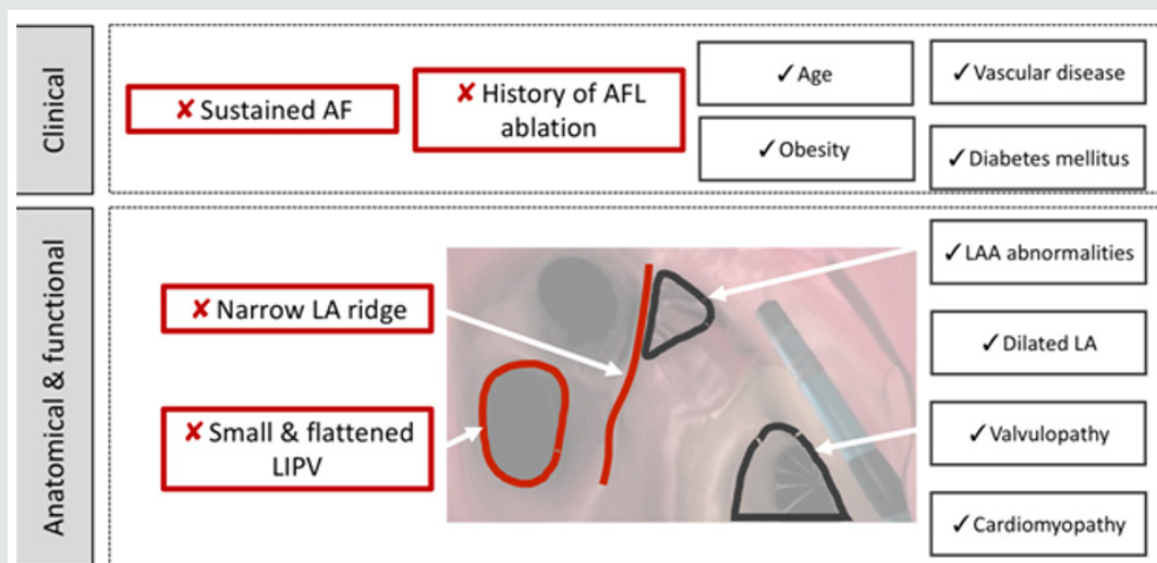
Figure 2: Central figure: Clinical, hemodynamic and anatomical factors influencing the stereotaxic AF ablation duration.

This figure summarizes results of the univariate analysis. Image corresponds to an endocavity view of the left atrium with a septal view. AF=atrial fibrillation; AFL=atrial flutter; LIPV=left inferior pulmonary vein; LA= left atrium; LAA=left atrial appendage.