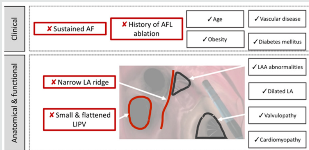
Figure 2: Central figure: Clinical, hemodynamic and anatomical factors influencing the stereotaxic AF ablation duration.

This figure summarizes results of the univariate analysis. Image corresponds to an endocavity view of the left atrium with a septal view. AF=atrial fibrillation; AFL=atrial flutter; LIPV=left inferior pulmonary vein; LA= left atrium; LAA=left atrial appendage.