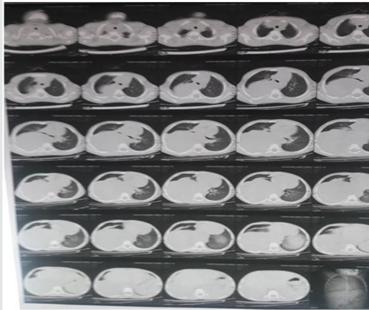
Figure 3: CT chest pulmonary window.