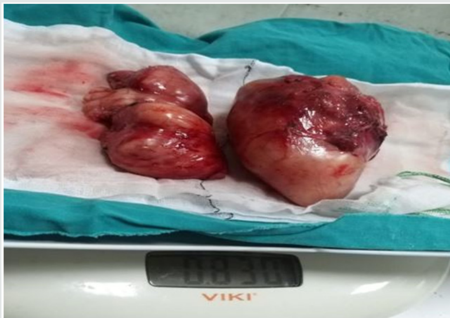
Figure 4: Ganglioneuroma after surgery (weight 830 gm).