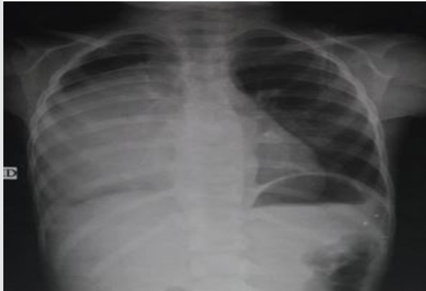
Figure 1: Chest X-ray P-A view showing. Giant opacity occupying most of the right hemithorax.

General examination of the child was unremarkable. Chest examination revealed decreased air entry on the right back of the chest with scattered rales. All laboratory investigations were within normal level. CT scan of the chest was done (Figures 2&3) and revealed a giant, non enhancing about 20 X 23 cm well-defined, more or less rounded mass which is homogenous and non-enhancing. The mass was located on the right hemithorax in the posterior mediastinum. The mass was abutting the thoracic vertebrae in the paravertebral gutter. CT guided needle biopsy was taken and histopathology report revealed a ganglioneuroma. After histopathological diagnosis, the patient was referred to the Thoracic surgery department at our hospital for surgery. Surgical