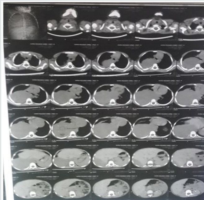
Figure 2: CT chest mediastinal window.

resection of the tumor was performed by a team of thoracic and neurosurgery via right slanted postero-lateral thoracotomy in the fifth space. During surgery the tumor was found to be well encapsulated with firm consistency, well circumscribed not invading any nearby structures. Due to the huge size of the tumor, it was resected in two pieces (Figure 4). During operation there was considerable bleeding, so intraoperative embolization of the feeding vessels that stopped the bleeding. The weight of the tumor was 830 gm (Figure 4). Postoperative histopathology confirmed that the tumor was benign ganglioneuroma. The patient had uneventful postoperative course and was discharged from the hospital after 10 days in good condition for regular follow up.