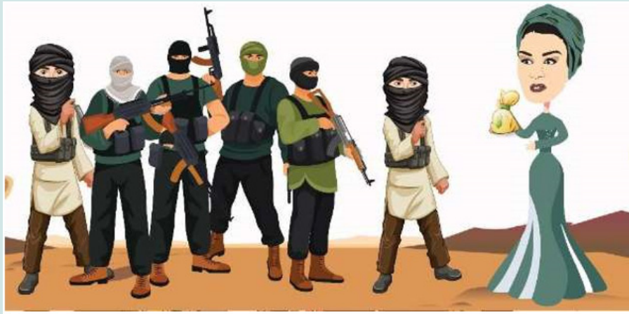
Figure 2: Media Manipulation through Al Jazeera.

messages, Al Jazeera amplifies their reach and impact, creating an exaggerated perception of their strength Figure 2. This strategy serves to instil fear and manipulate public opinion, making these groups appear more formidable than they truly are.