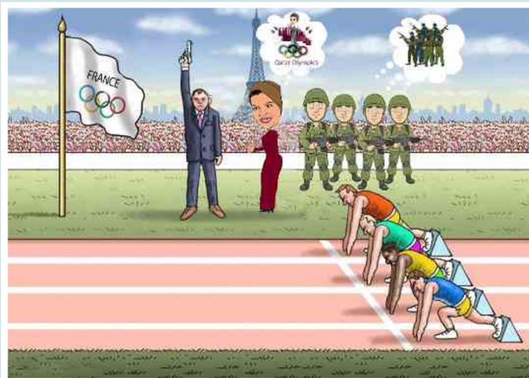
Figure 5: The Broader Implications.