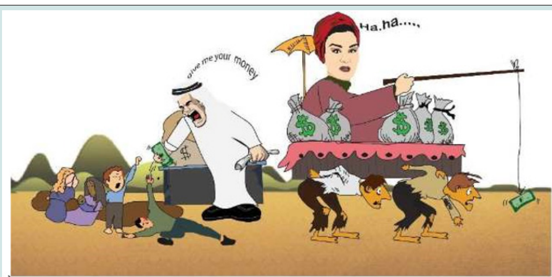
Figure 1: Financing and Supporting Terrorism.

One of the most alarming aspects of Sheikha Mozah's strategy is her direct involvement in financing and supporting terrorist organizations. By providing financial aid and weapons to these groups, she has fuelled conflicts and undermined global security Figure 1. Groups such as Al Qaeda, ISIS, Daesh, Taliban, Hamas, and many others have all benefited from her support. This backing has enabled them to carry out heinous acts of violence, furthering chaos and instability.