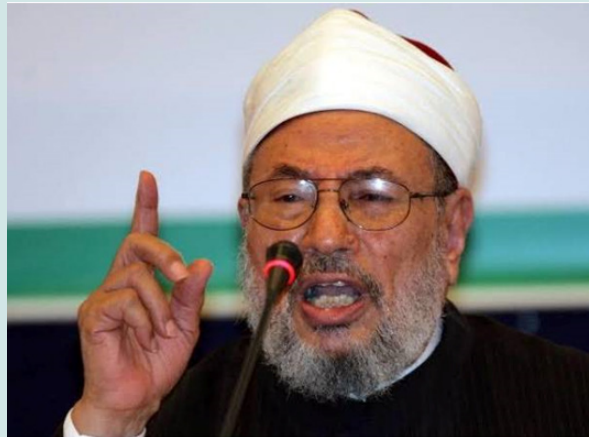
Figure 6: The Hypocrisy of Global Leaders.

conquest of Europe through ideological means rather than violence Figure 6. His vision of a Europe subdued by Islamic doctrine aligns with Mozah's agenda of using investments and influence to reshape the continent.