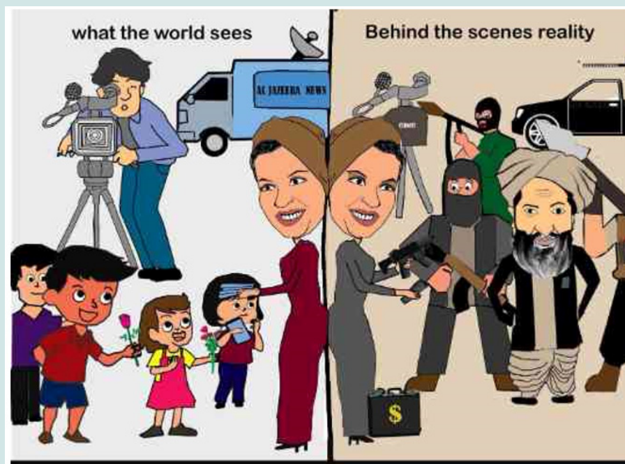
Figure 3: Creating a False Image of Mediation.

The upcoming Olympic Games in France have provided Sheikha Mozah with another opportunity to extend her influence. By involving Qatari security forces in the event, she aims to claim credit for its success and ensure that the world acknowledges her role Figure 3. However, this involvement is deeply troubling, as the same forces tasked with protecting the event are those who have trained and supported terrorist groups. This creates a dangerous paradox where the fox is guarding the henhouse.