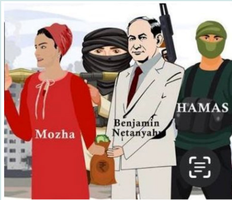
Figure 4: The True Motive behind Involvement in France.

her influence, she ensures that decisions are swayed in her favour Figure 4. This relentless pursuit of attention and power comes at the expense of global security and stability Figure 5.