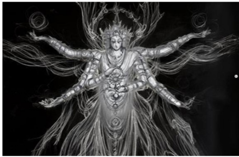
Figure 8: Asurais, a god-like being with powerful fighting capability. They live in cities near the bottom side of Sumera (Mt. Meru). They communicate each other by hearts (mind thinking). They have a higher dimension than modern people: modern human cannot see them, but they can show their body to human if they want. It was translated as Demigod by Buddhism or Hinduism scholars; but they are not demigod because demigod is a word from Greek meaning the part-human and part-divine offspring.

Decline of Morality. At the early stage, human can fly both in sky and in the ocean. They can emit light. Thank to eating foods from the earth, they lose some power and lose the god-like image. Some of them, who eat less earth food, have a more glorious look than those who eat more earth food. They start decimations based on people's outlook appearance. They insult one another, become jealous and laugh at each other: you are ugly... what... you are ugly... They start to do bad deeds. Because of the law of karma, they lose more power and life spans. Later on, they are committed to adultery. Further, some people start to store food for their future, and the "self" concept starts emerging. Even though, they still have better images, extremely longer life span and more giant body than modern humans can imagine.