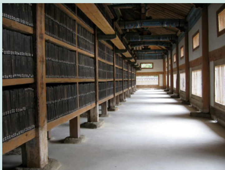
Figure 1: The Great Canons of Buddhism records the Buddha's teaching. Despite of missing books throughout thousands of years of history, there are still huge volume left, enough to fill a community library.

On the other hand, in Eastern, the Great Canons of Buddhism (Great Canons) are the record of Buddha's words and actions. In Buddhism, the canons refer to the sacred texts, authoritative and foundational to the teachings of the Buddha, Siddhartha Gautama, who delivered teaching for over 40 years. There are huge volumes of canons transcribing his words into scriptures (books, Figure 1). Such canons are rarely known to the western wisdom due to the cultural and language boundaries.