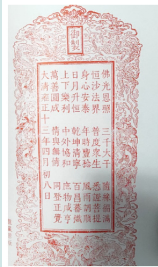
Figure 7: The preparation for Great Canon of Qianlong starts from the 13th year when Qianlong's father becomes the Yongzheng King. The picture shows this work is ordered by the Yongzheng King, who also wrote the dedication part for this collection. The four characters near the left bottom corner is translated as "Dragon Tri-pitaka authentic version".

The Great Canons of Buddhism preserved the records about the Buddha's observation by his superpower on the earth, the universe and the human history. Due to language boundaries, not many scholars are able to read. Regarding our human and earth histories, there are more details recorded in these Great Canons. The following texts will discuss the view from Siddhartha Gautama, who is commonly referred as the Buddha.