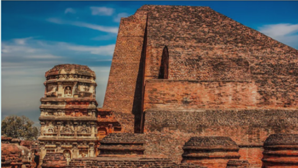
Figure 4: The Nalanda College in India was a college influencing the world in ancient time. It has millions and millions of collections of Buddhism scriptures. Due to historical reason, it has become relics. Before this happened, some of the Buddhism scriptures have been translated to other languages and spread into other countries. Now, some Indian scholars have seek the help of other countries to translate back from their collections.

canon collections are from the translations after that dark age. All three systems of canons (in Pali, Chinese and Tibetan languages) have records about the universe, the earth, and human history.