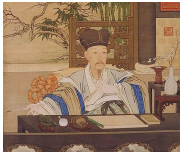
Figure 6: Another portrait of Qianlong Emperor. In this portrait, he looks more like a scholar. Actually, he has another career: a great scholar with 10,000 poem left in this life. In addition to Great Canons of Buddhism, he also contributes to the production of another huge collection for all known books at his time.