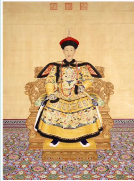
Figure 5: The official portrait of Qianlong Emperor, who is a key funder to produce the Great Canons.

or followers, but not all the books can be included into Bible, since it is a very serious scholarly event. Thus, the writings in the Likely Volume will not be quoted for this study.