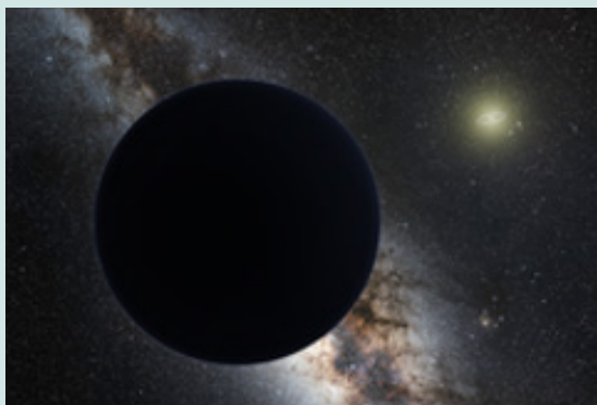
Figure 9: The artistic drawing of the planet Nibiru, according to Shumer Civilization. It might be similar some-thing mentioned in Buddhism literature as discussed in the above text. In addition, some scientists believe it could be the 9th planet in the solar system; in Tibetan time-wheel calendar, there is also an invisible star called Luohou star; however, more evidence are required to support these kinds of speculations.

culture. Likely, the neighbor may use an obvious symbol (like a mount symbol) to refer Shumer people/culture. Taken together, it is possible that the Nibiru in Shumer culture might refer to the same planet of “Sumeru” (Mt Meru) in Buddhism.