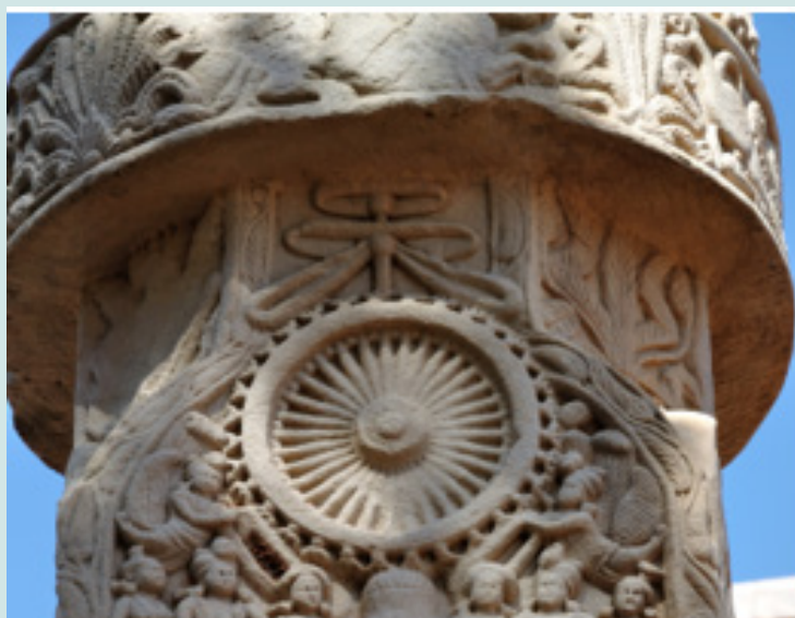
Figure 10: Gold Wheel carved into stone with other figures. According to Buddhism and Hinduism, there are an-cient powerful kings who were known as the wheel-rotating kings, because they always have a gold wheel that can fly.

Right-Knee King's son is the Left-Knee King, whose can rule over one major planet, our earth. From then on, no more human king can rule other planets anymore. In Buddhism and Hinduism, the best powerful king is called wheel-rotating king be-cause he has a gold wheel, which can fly (like a today's so-called UFO, Figure 10). From then on, all wheel-rotating kings from our earth are only able to rule the earth, unable to rule other planets.