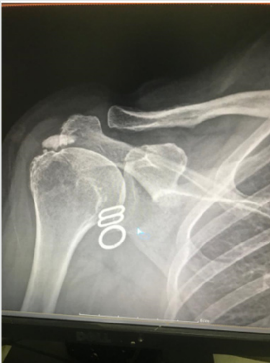
Figure 1: Removing shoulder calcification 1.

Removing shoulder calcification has already been reported [1], as shown in these two x-rays: (Figures 1&2).