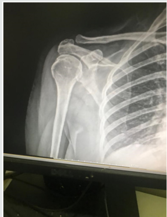
Figure 2: Removing shoulder calcification 2.

The doctor had expected to have to surgically remove the calcification with all the side effects, pain, time and cost this involves. To see the calcification “disappear on its own” was an