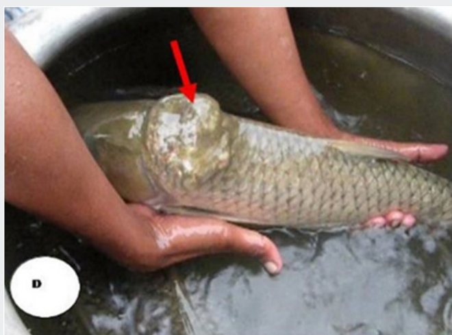
Figure 1: Tumour like lump on upper Cephalo -thoracic region, a potent candidate as brood fish.

programme is the necessity of the modern breeding programme. The culling of fish could be based on the criteria based on the phenotype of fish such as growth, disease, deformity, age, size, and most catchable fish than least catchable during harvesting. No such activity was adopted by any of the fish seed producers of the study area, instead one of the breeder was seen injecting a grass carp fish for induce spawning with a tumour like lump on the skull region of the fish (Figure 1). According to the information provided by him, it was learnt that he has been breeding the same fish for the last couple of years. Table1 conforms that majority of the breeders have no idea about the importance of culling of fish from the breeding programme. Quality deterioration finds its easy routes when a diseased fish used as brooders.